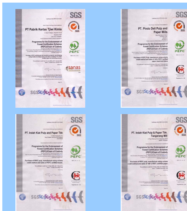
PEFC CoC Certificates for APP mills

To date, four of APP's paper mills (Tjiwi Kimia, Pindo Deli, Indah Kiat Serang, and Indah Kiat Tangerang) have earned Chain-of-Custody (C-o-C) certification according to the PEFC standard. This certification signifies that these mills can make credible claims on the content of PEFC certified fibers in their products coming from sustainably-managed forest.